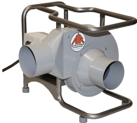
1.5 HP TEFC motor, 6" Intake/Outlet